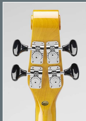
• Machine head detail