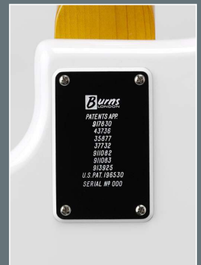
• Limited Edition number