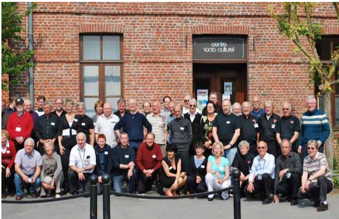
Some of the players with their wives and friends at the venue in Fleurbaix